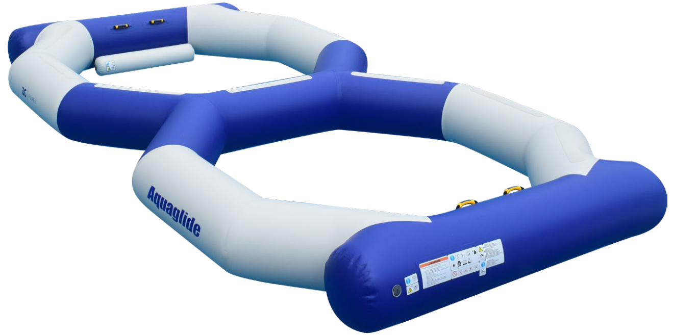
Figure 8 is a unique balance obstacle that presents a distinct challenge consisting of two 'S' shaped routes. The easier path is paved with mildly textured Tritex material for more positive traction, while the more challenging route is likely to test the skills of even the best among us. Interior boarding tubes and handles help users reboard easily after a splashdown. Connects to any aquapark on two ends using our Interlock connection system.

L 32" x W 24" x H 16", 97 lbs. 1 pc. (L 80cm x W 60cm x H 40cm, 44 kg)